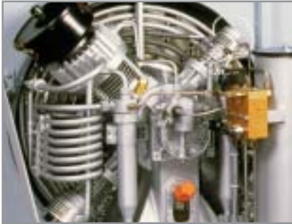
extremely robust blocks