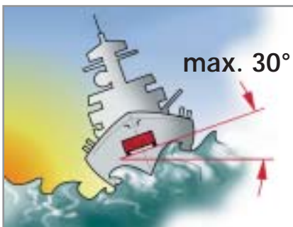
operation even on heavy sea